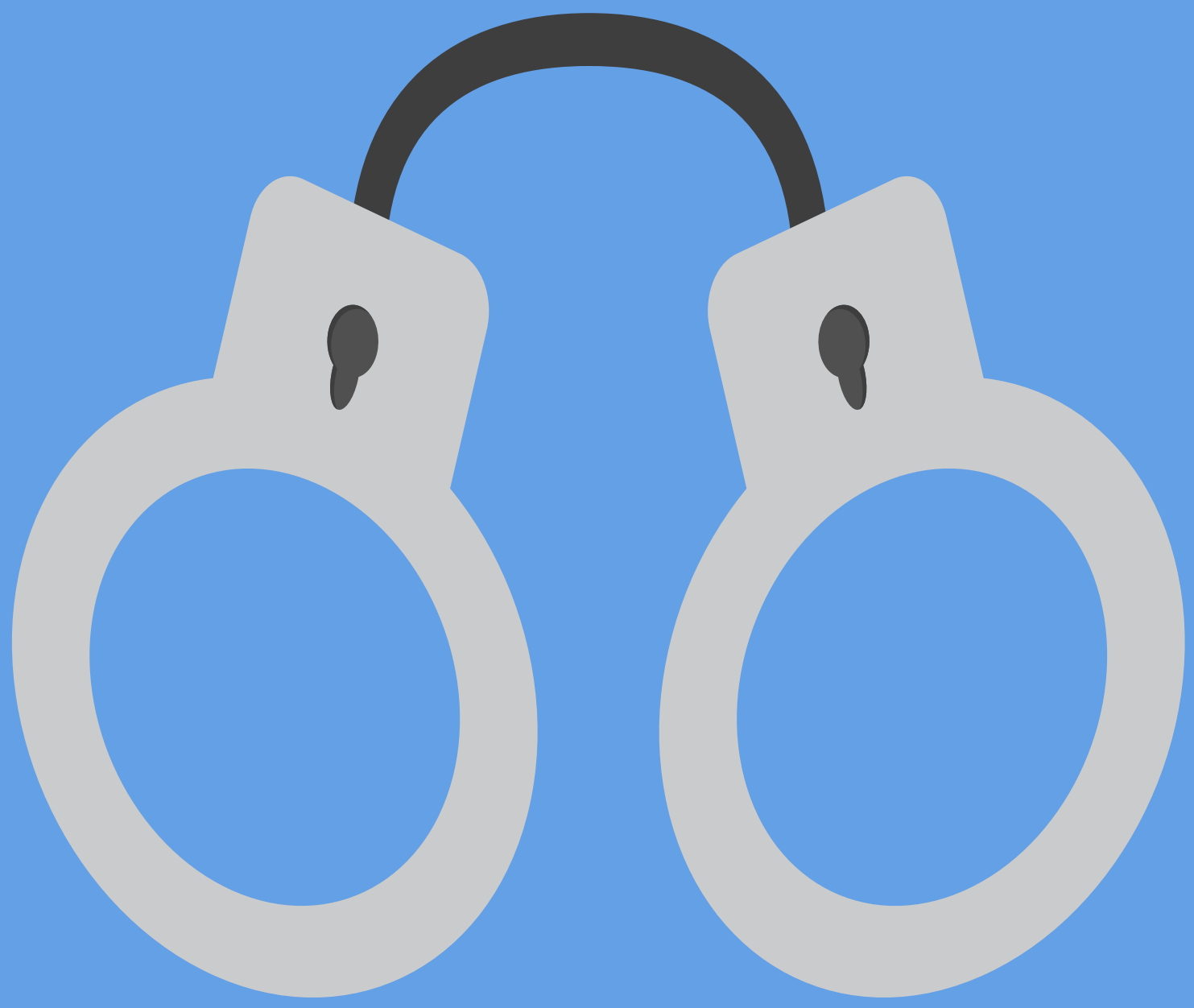
Arrest by different terrorist group